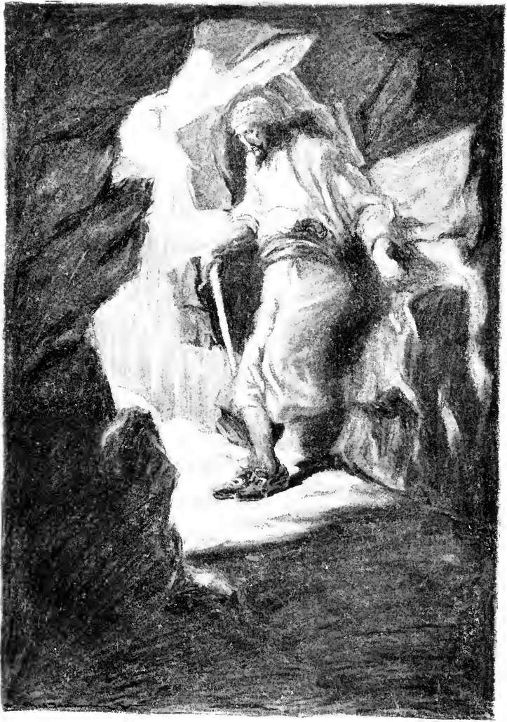
Allowed his head to drop on his breast, as if saddened by the vanity of human ambition